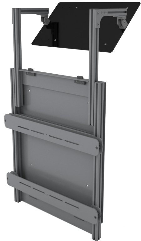
Vertical Mirror Mount Up - Rear view

VERTICAL MIRROR MOUNT UP [DT-VMM-UP] - ON WALL PROJECTOR MIRROR MOUNT FOR LENS POINTING UP AND PROJECTOR BASE FACING AWAY FROM THE SCREEN