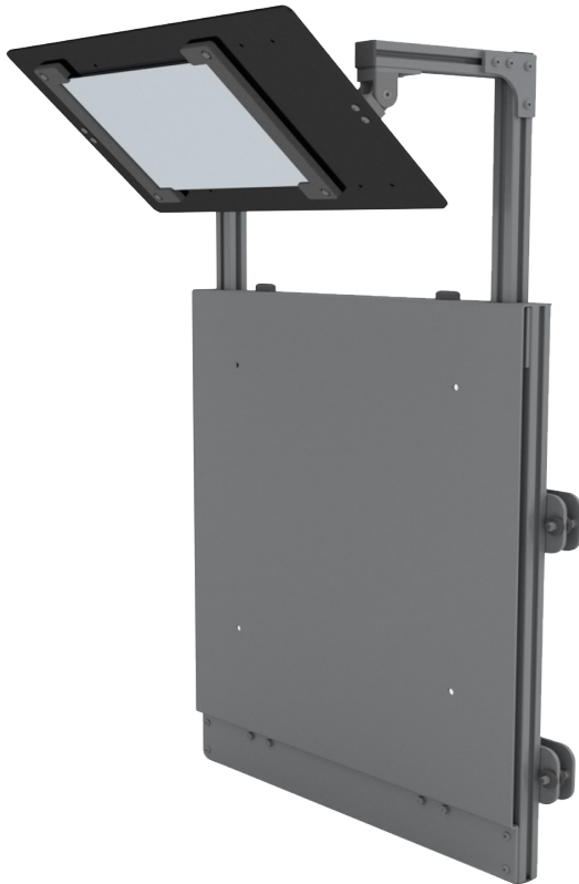
Vertical Mirror Mount Up - Front view